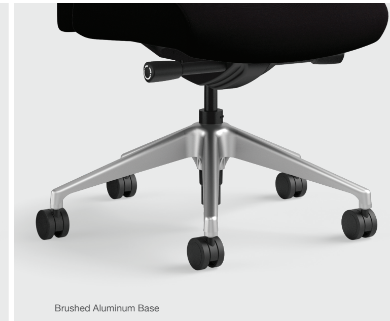
Brushed Aluminum Base