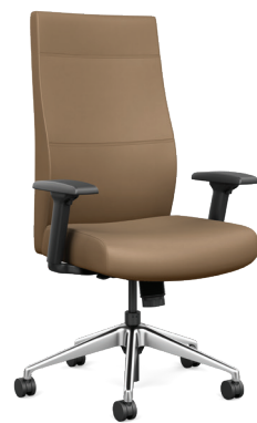
HIGHBACK TEXTILE: SitOnIt Slide Desert