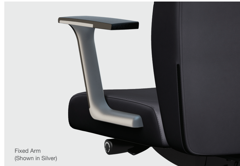
Fixed Arm (Shown in Silver)