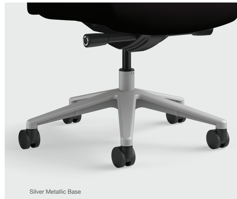
Silver Metallic Base