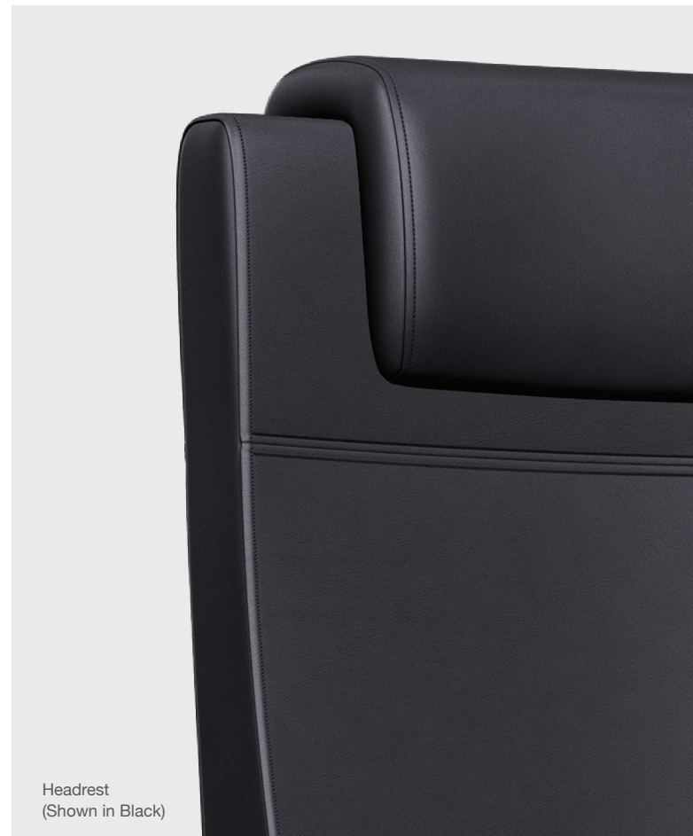
Headrest (Shown in Black)

Our Prava's mixed-media arm bears Pensi's signature cast-aluminum design—the contemporary fusion of aluminum and plastic adds a subtly modern touch to any room.