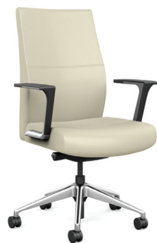
MIDBACK TEXTILE: Maharam Lariat Ivory