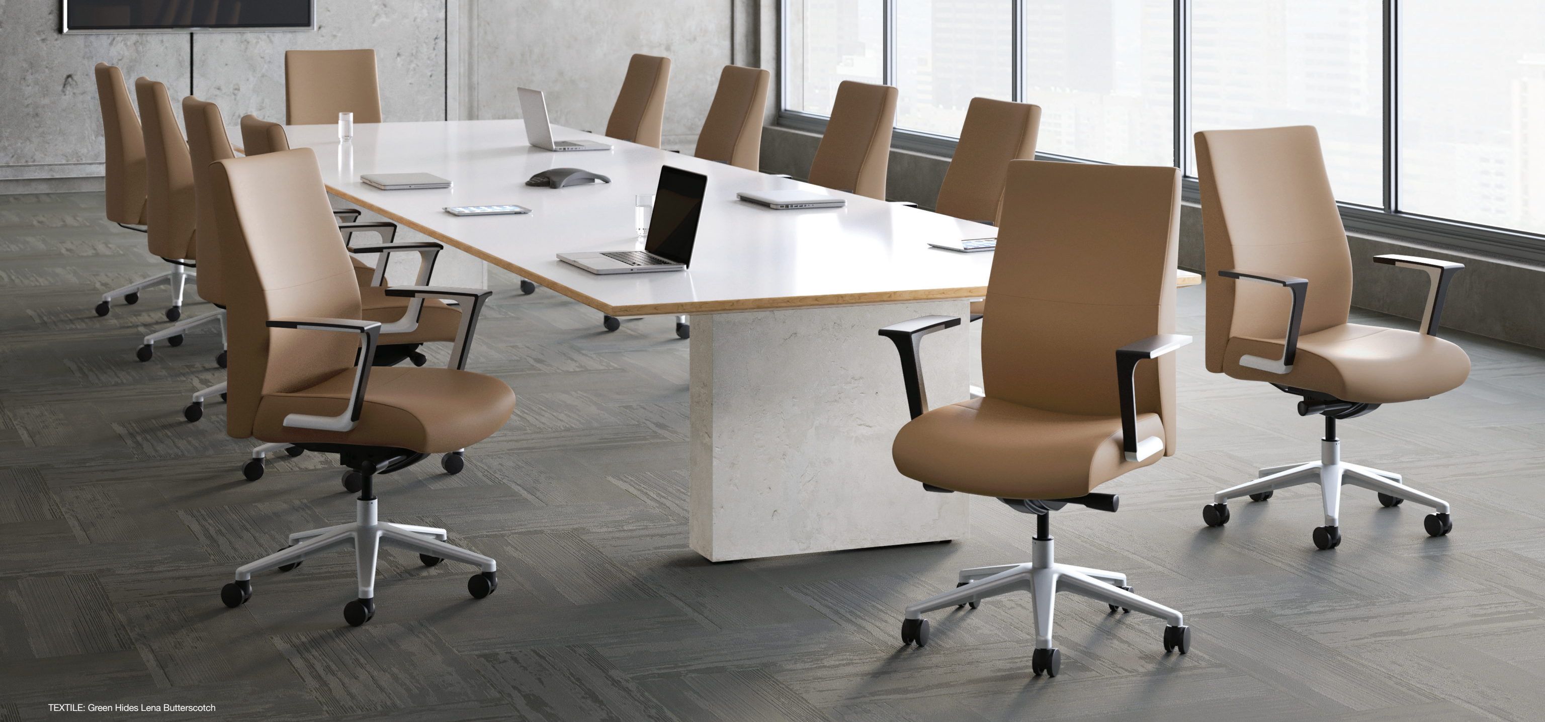
TEXTILE: Green Hides Lena Butterscotch