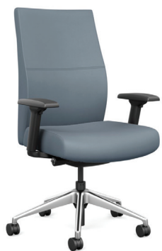
MIDBACK TEXTILE: SitOnIt Seating Sili-Tex Original Thunder