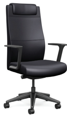
HIGHBACK (WITH HEADREST) TEXTILE: CF Stinson Laredo Onyx