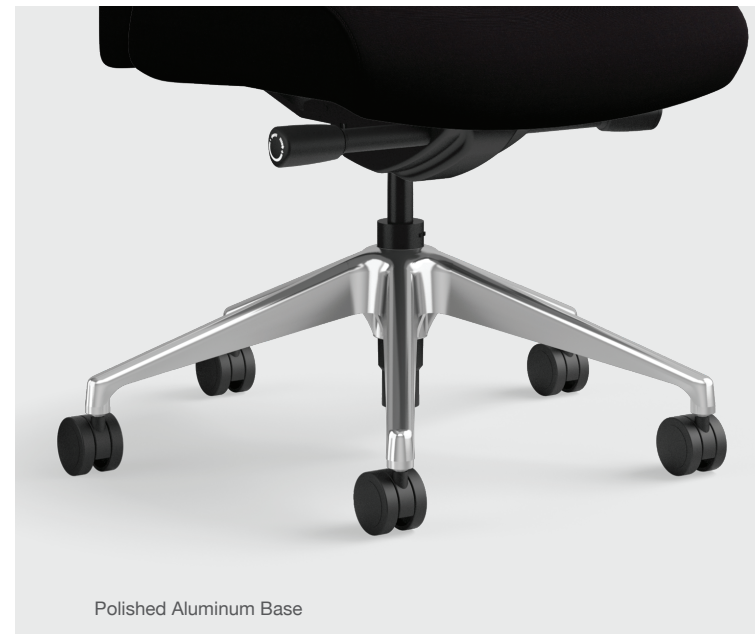
Polished Aluminum Base