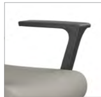
Fixed Open Loop -Black