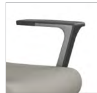
Fixed Open Loop -Silver