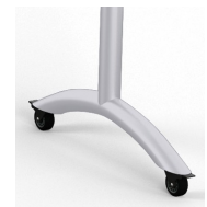
Arched Available with 24" D & 30" D tables