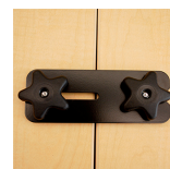
Quick Align Table Connector