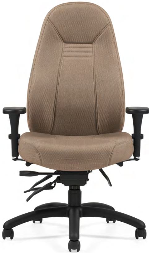
1240-3 High Back Multi-Tilter in Momentum, Tek Echo with Black base.

Select models feature depth adjustable lumbar support. All models feature contoured seat, seat depth adjustment, height and width adjustable arms. Available in fabric, vinyl and leather upholstery.