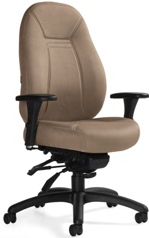
1241-2 Medium Back Knee-Tilter in Momentum, Tek Echo with Black base.