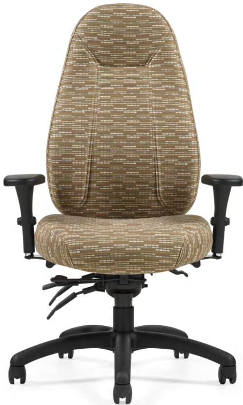
TS1240-3 High Back HD 24 HR Multi-Tilter in Momentum, Flux Dune with Black base.

Obusforme Comfort Series is renowned for providing exceptional back comfort that cannot be compared to any other seating product.