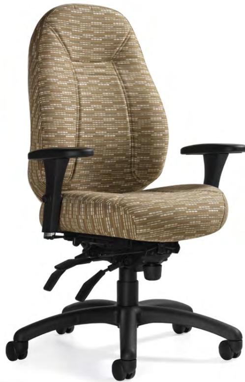
TS1241-3 Medium Back HD 24 HR Multi-Tilter in Momentum, Flux Dune with Black base.