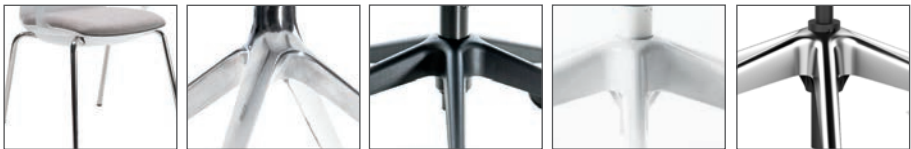
4-leg polished aluminum