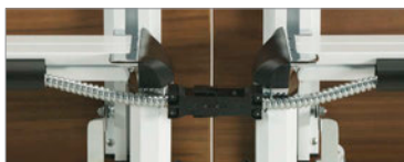
Optional daisy chain power management