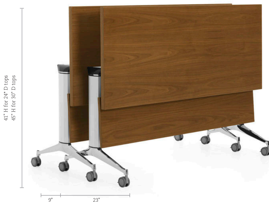
Optional modesty panel articulates with table top in upright position.