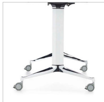
Leg column and cross beam available in a full range of finishes (Designer White shown). Foot is standard in Polished Aluminum