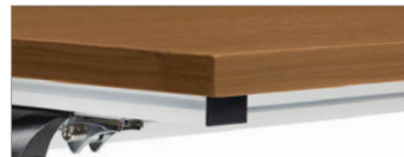
Table tops available in a large variety of veneer finishes (Latte Walnut shown)