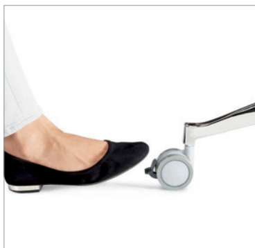
Locking dual wheel casters swivel 360°