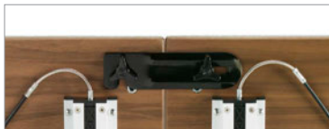
Optional ganging plates