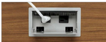
Optional power block includes power and data