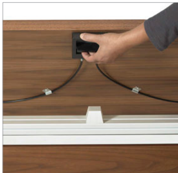
One handed flip up operation