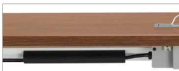
Optional wire management snap-in channel