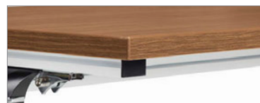
Table tops available in a large variety of laminate finishes (Walnut Heights shown)